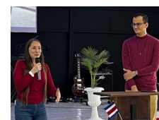
Pastors serving Los Guido Church in San Miguel, Costa Rica.

Thank you for sending me. I wish you could have all been there with me. It was my honor to get to represent you and the people of our Trinity Conference from Arkansas, Louisiana, and East Texas. Our next General Conference will be in two years in West Africa. After that, the General Conference will meet every six years.