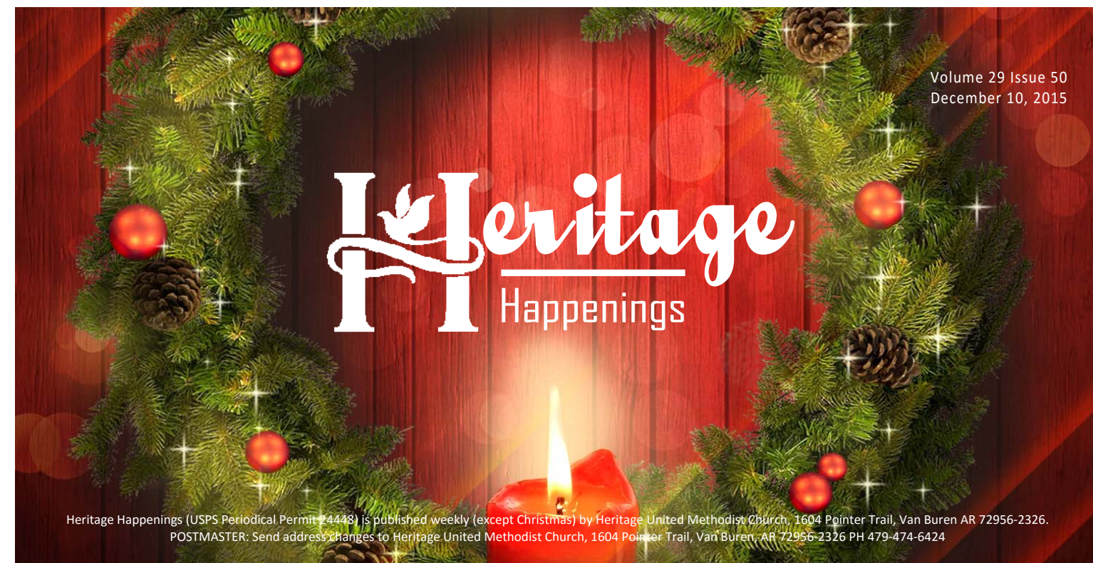
Heritage Happenings (USPS Periodical Permit 24448) is published weekly (except Christmas) by Heritage United Methodist Church, 1604 Pointer Trail, Van Buren AR 72956-2326. POSTMASTER: Send address changes to Heritage United Methodist Church, 1604 Pointer Trail, Van Buren, AR 72956-2326 PH 479-474-6424