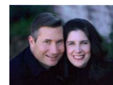
Still in awe!

I love what Proverbs 24:16 says, "For the righteous may fall seven times and rise again, but the wicked shall fall by calamity." Praise the LORD for our God of grace and healing and restoration! I will rise again and fulfill the destiny God has for my life, and so will YOU! Even greater, together we will fulfill the dreams God has for our faith community. Come this Sunday as we dare to dream God's dreams for His Church and as we dare to become such a Spirit-filled, called-out assembly of citizens authorized to reign with Messiah! We will celebrate YOM KIPPUR, the Day of Atonement, as we humbly receive Holy Communion!