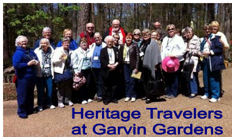
Heritage Travelers at Garvin Gardens