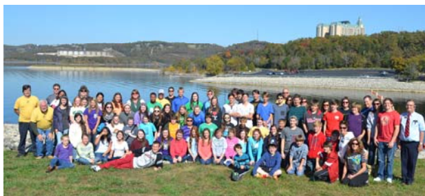
PULSE and The Beat at their Fall retreat in Branson, Missouri.