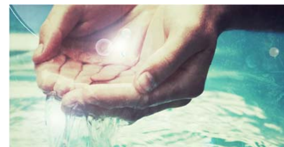
Water of Life

I sense the LORD's nearness ... I sense His earnest desire to move mightily in our midst—to wash over us with His holy presence. Lately, every Sunday I come to worship thinking, "Maybe this will be the Sunday that Jesus will manifest His glory in our midst." I see Him working in so many of you! I wonder what it is going to take. I know the LORD is willing. What will "tip the bucket" of the LORD? What will bring the LORD to say, "Now, you are ready to receive what I have longed to give you!"?